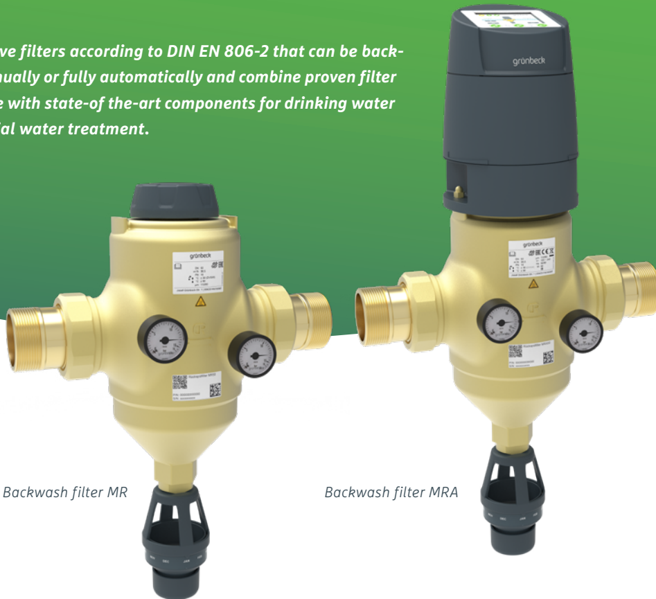
Backwash filter MR

The protective filters according to DIN EN 806-2 that can be backwashed manually or fully automatically and combine proven filter performance with state-of-the-art components for drinking water and industrial water treatment.